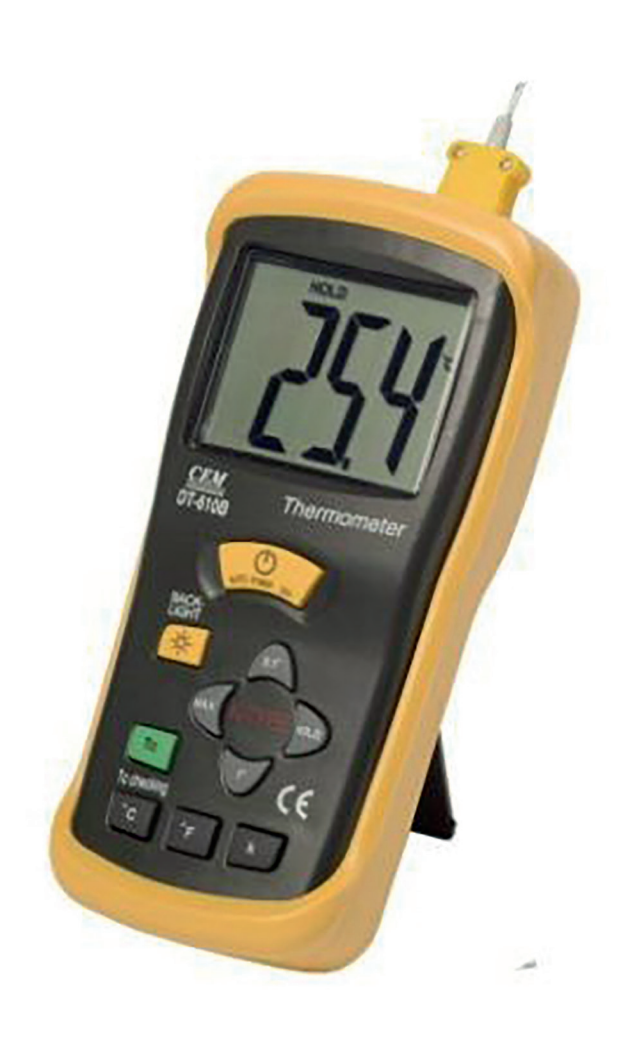
Fig. 1.2 for Question 1 Digital thermometer